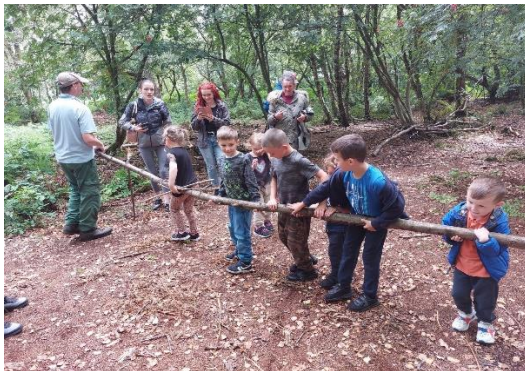
East Childrens Centres

And here’s a link to a video of the HAF programme with Computer Xplorers: (8072) Warrington HAF Summer 22 @ CompXBolton - YouTube