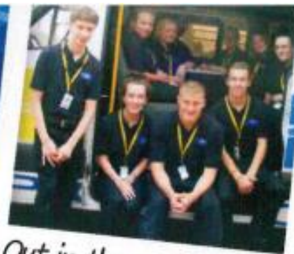
Out in the community