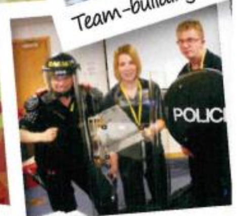
Using the kit